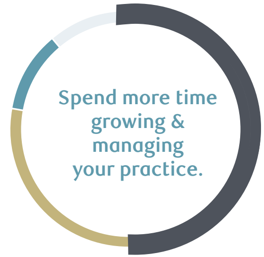
For illustrative purposes only.

With our help and support, you can spend less time on reviewing investments, rebalancing portfolios, and managing performance. You have more time and resources supporting you so you can focus on your business.